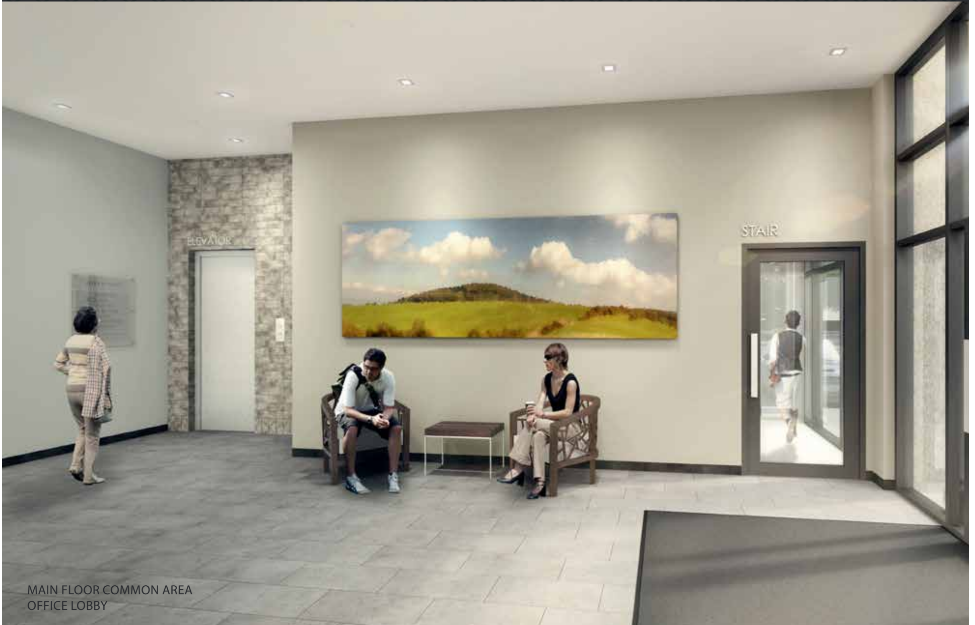
MAIN FLOOR COMMON AREA OFFICE LOBBY